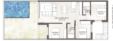
VILLA Nº 2