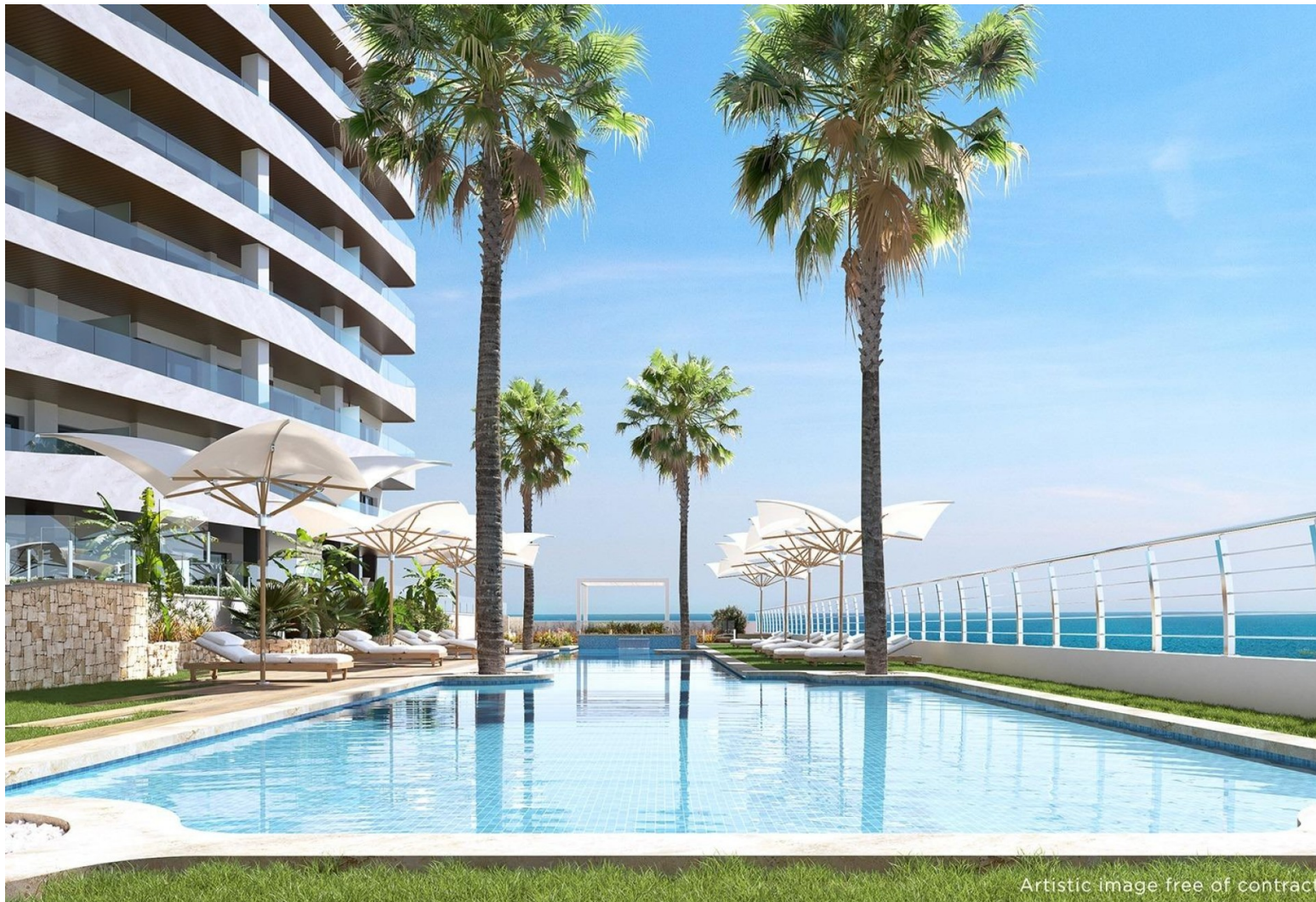
Artistic image free of contract