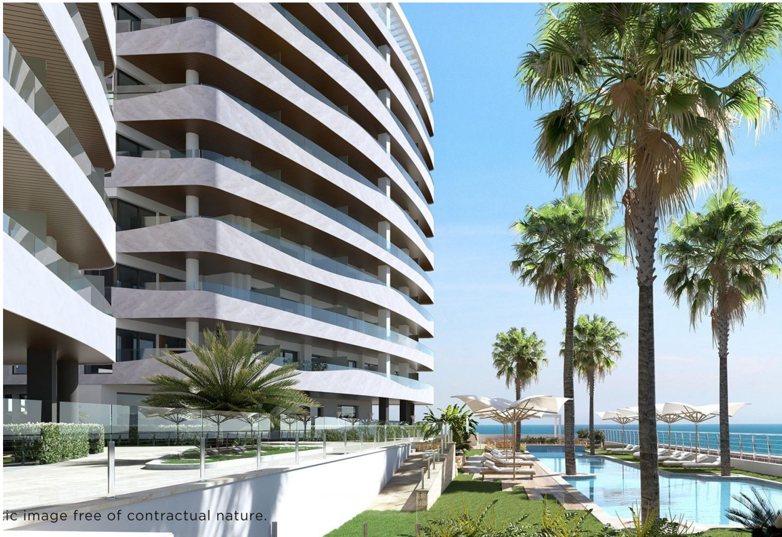
Image free of contractual nature.