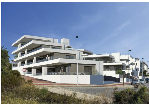
BLOCK 1 - House 20-22-24-26-28-39-41-43-45